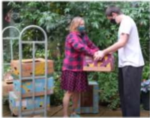
Delivering food boxes to a nearby apartment complex