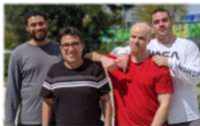
Enjoying the sunshine