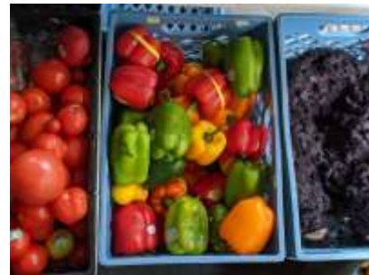
Vegetables from Grocery Rescue

By the Numbers: 6,647 households served 9,932 individuals served 303,458 lbs. of food distributed 181 volunteers 1,000 home deliveries 264 new households served