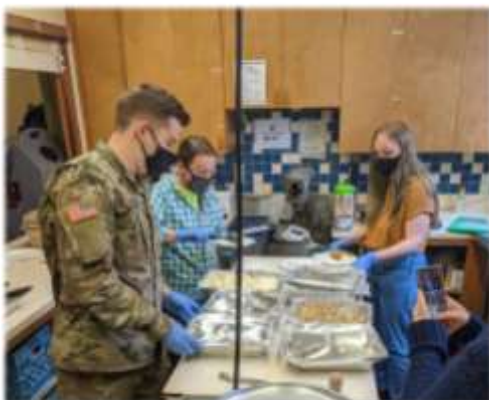
Staff & National Guard members preparing the Thanksgiving meal for our Hygiene Center guests