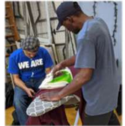
Providing dignity through ironed clothing