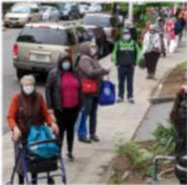
Shoppers waiting in line physically distant