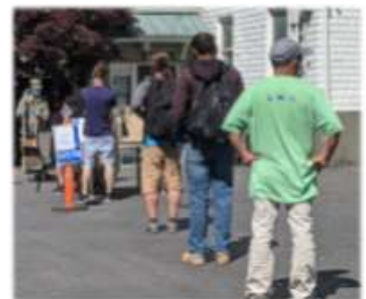
Waiting for a pre-packed To-Go bag