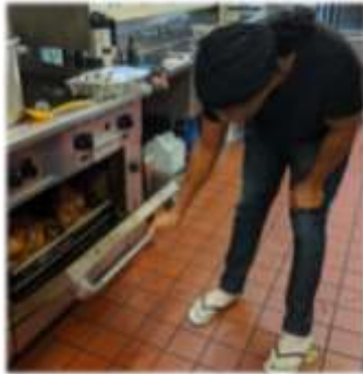
Helping prepare Thanksgiving Meal