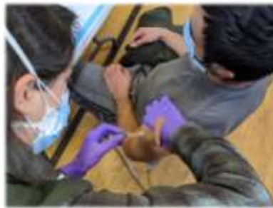
Flu shot day at ICS!