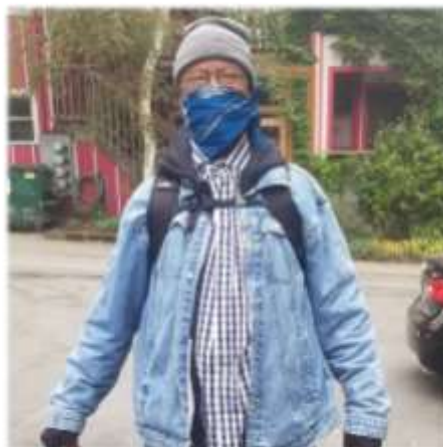
Hygiene Center guest grateful for a referral to a bed in the emergency smoke shelter