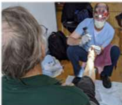
Podiatrist volunteer caring for the feet of our unsheltered guests