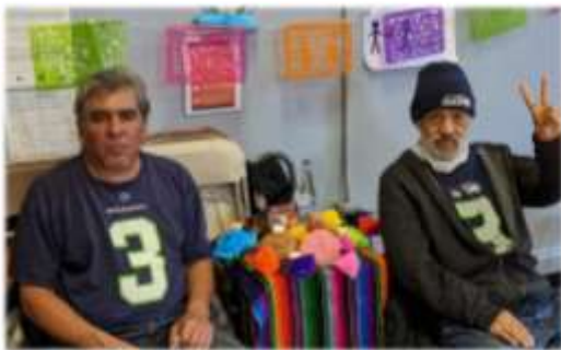
Celebrating Día de los Muertos (Day of the Dead), a Latin American holiday remembering loved ones