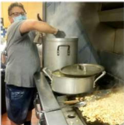
Volunteer cooking lunch