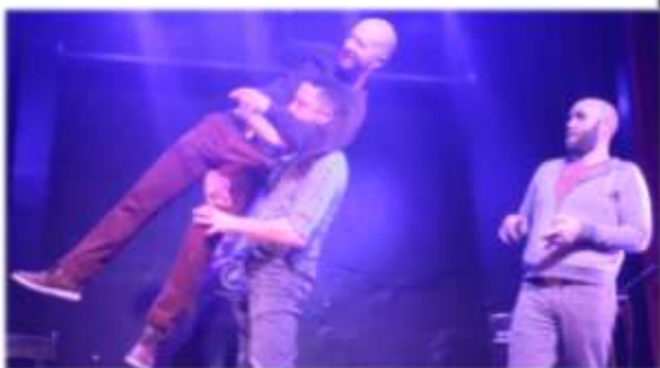
Improv by Slap Bracelets!