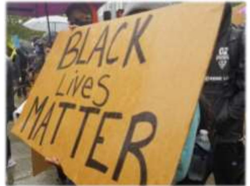
Staff members participating in Black Lives Matter march