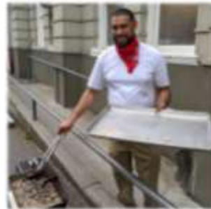
Using the new BBQ