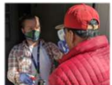
Taking temperatures at the door