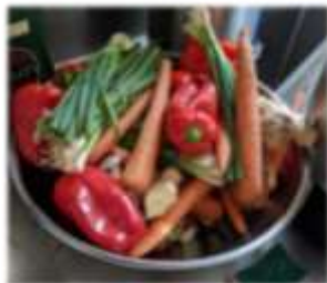
Veggies reporting for duty!