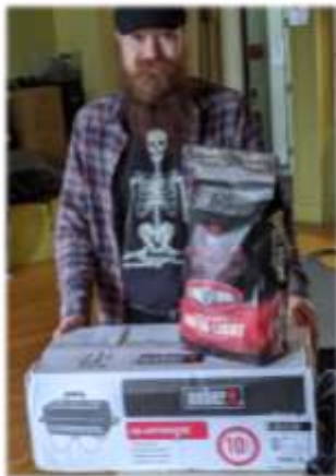
Receiving a new BBQ gift from the Union