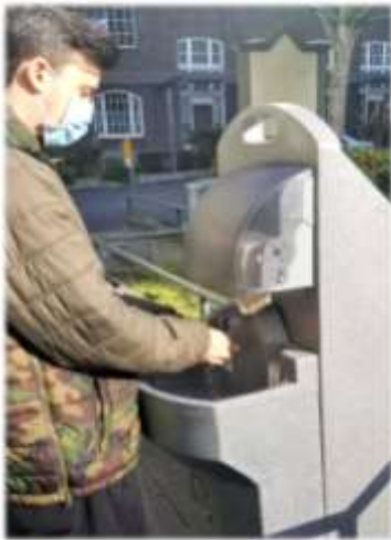
Washing hands before receiving food