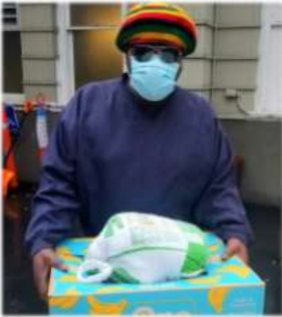
Food Bank visitor receiving a Thanksgiving turkey