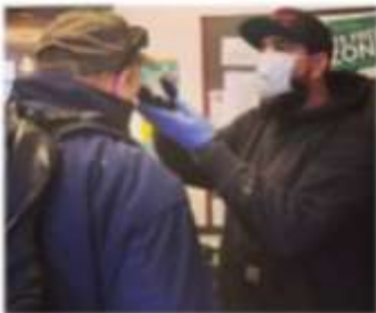
Volunteering at the Food Bank