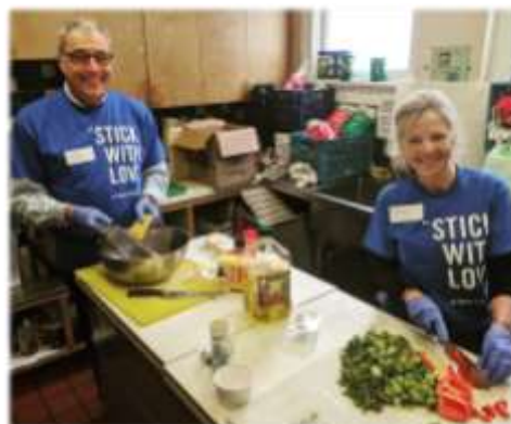
Martin Luther King Jr. Day volunteers preparing lunch for the Hygiene Center, January 2020 (pre-Covid)