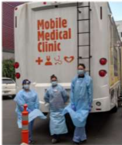
Covid-19 testing at ICS