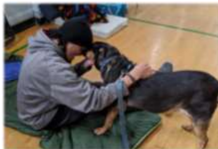
The four legged member of our staff visiting guests