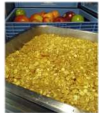
Janet's Famous Apple Crisp