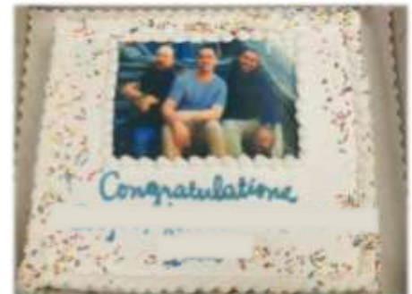
Celebrating Sober Anniversaries— Since quarantine began, 6 residents have celebrated a year of sobriety!