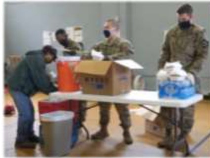
Serving lunch—Covid style!

Distributed thousands of masks and hundreds of gallons of hand sanitizer.