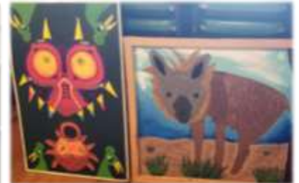
Artwork painted by quarantined residents