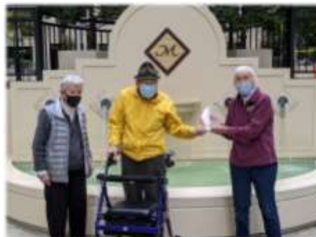
Mirabella residents receiving the 2020 Spirit of Hope Award