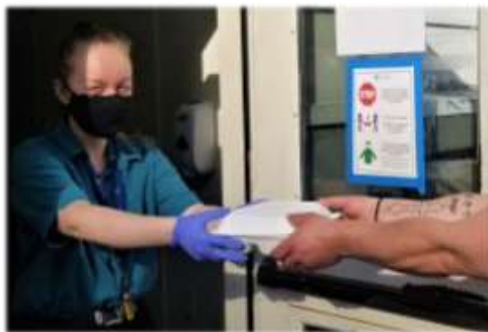
Volunteer handing out meals