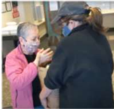
Volunteer doing a home delivery

By the Numbers: 6,647 households served 9,932 individuals served 303,458 lbs. of food distributed 181 volunteers 1,000 home deliveries 264 new households served