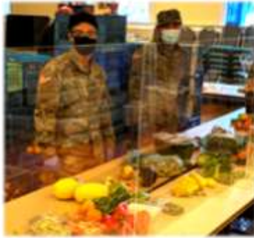
National Guard distributing food to shoppers