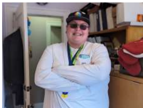
Recovery resident celebrating one year of sobriety