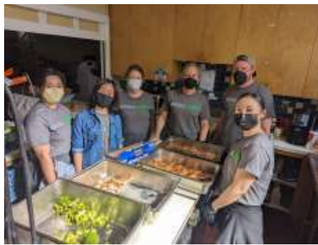
So many wonderful groups of volunteers!