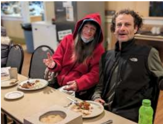
Guests enjoying lunch!