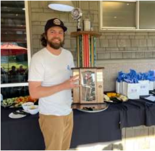
Team Murray's Paws for Care wins most funds raised