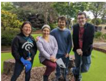
Another successful Putt-Putt