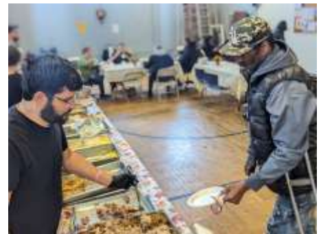
Serving in the Hygiene Center