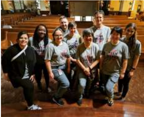
Volunteer group from Gilead