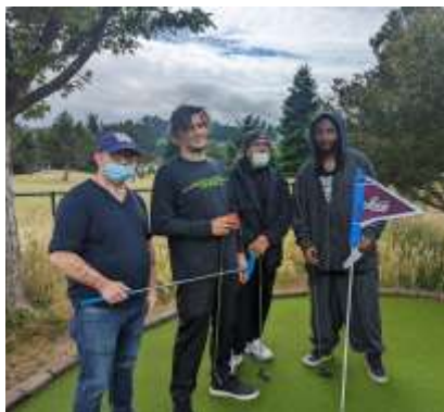
Recovery guys' Putt-Putt Team