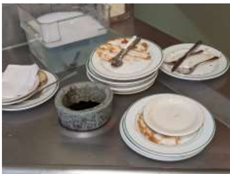
Signs of a delicious meal