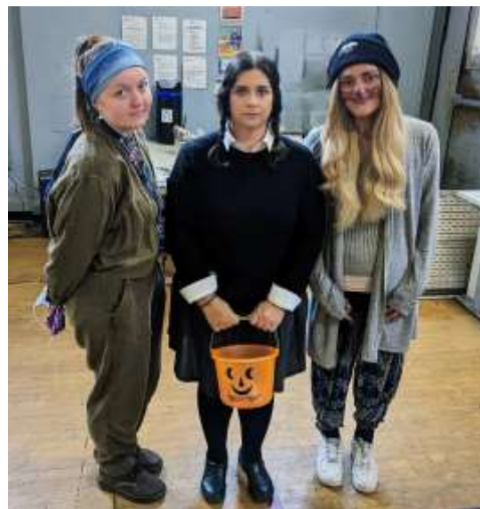
Staff & Hygiene Center guest at Halloween