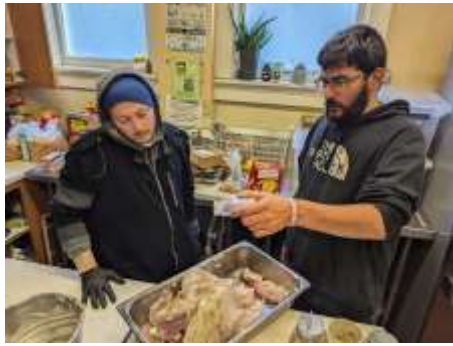
Cooking Thanksgiving Dinner