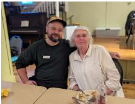
Enjoying a meal together

By the Numbers: 42 men stayed in our shelter 3,778 bed-nights provided 7,038 combined days sober for the residents who finished 2023 with us! (equivalent to more than 15 years!)