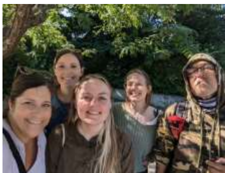
Staff team building day at the zoo!