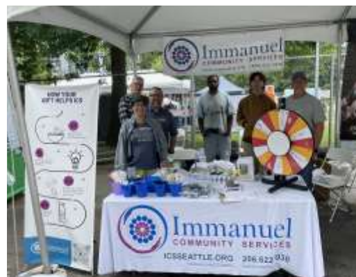
At the SLU Block Party