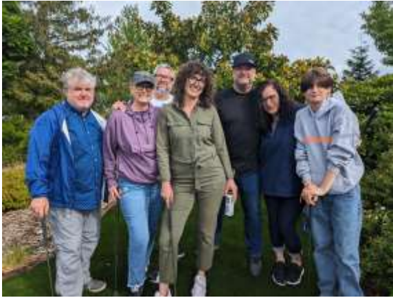
Team Dude, Where's My Par?