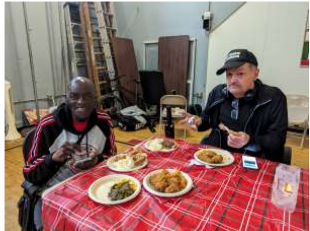
Celebrating the holidays