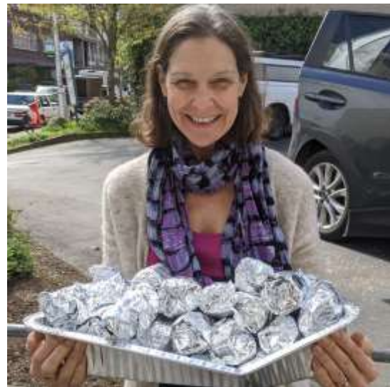
Union Church providing food for our Hygiene Center guests every Monday