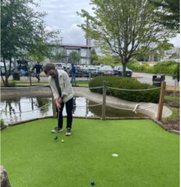
Lining up the putt!