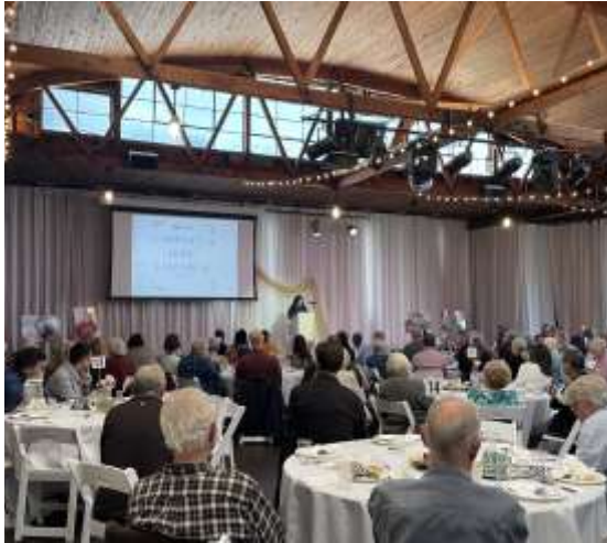
Crowded room at venue 415 Westlake!