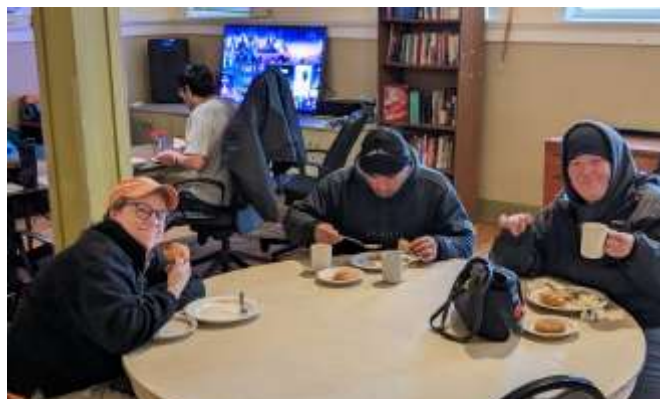
Familiar and new faces