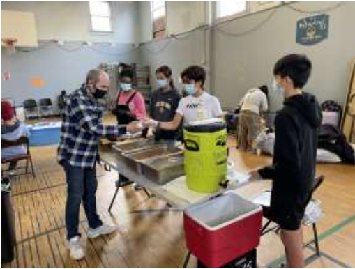
Lakeside School students serving lunch

We've seen an increase of volunteers post-Covid!