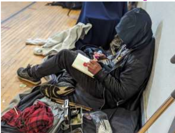
Hygiene guest painting