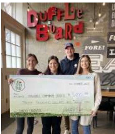
Participation in Flatstick Pub's Sunday Fundraise raised $3,000!