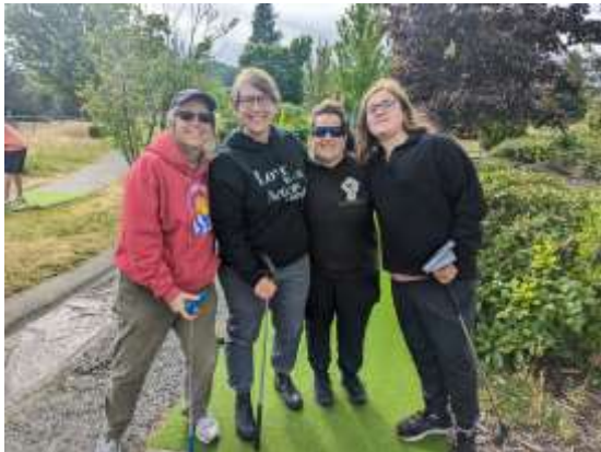
Team Comrades of Compass