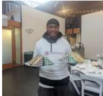
Serving lunch at Community of Hope Luncheon