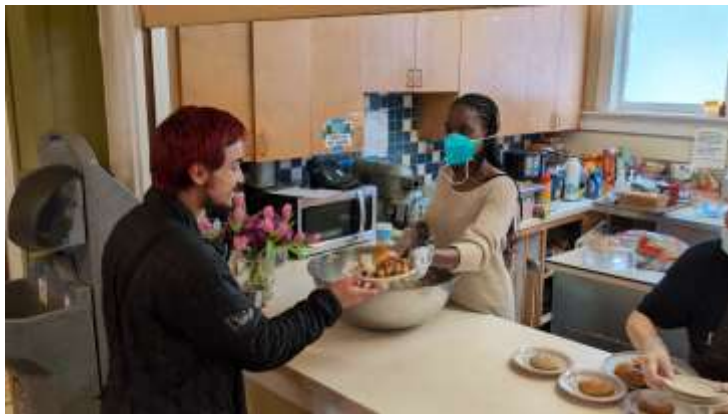
Volunteer handing out meals