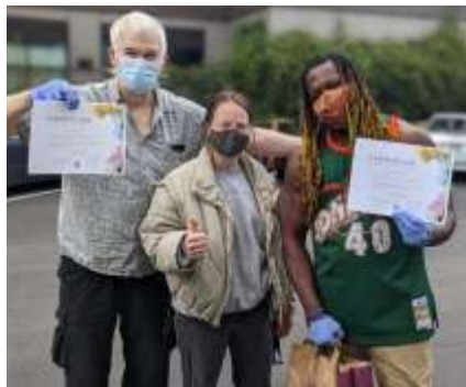
Volunteer Appreciation Day!