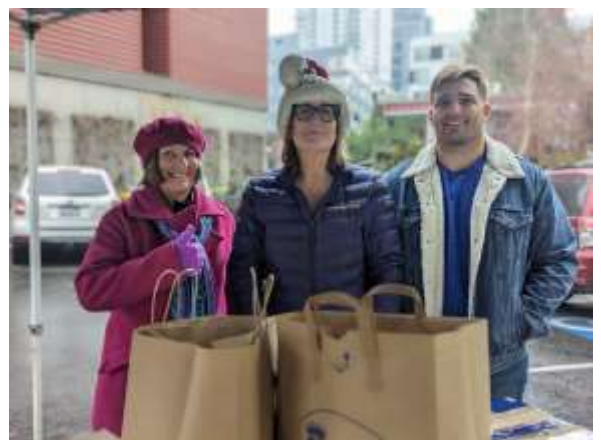
Volunteers at Monday's to-go table