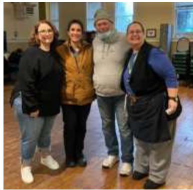
Neighbors at NanoString