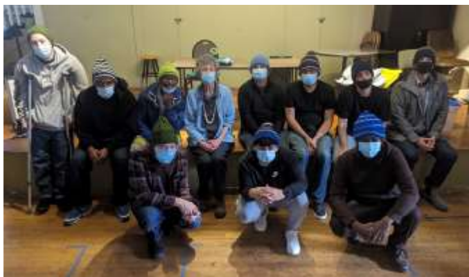
Sporting new knit hats from Marcy Golde