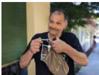
Hygiene Center guest with keys to new apartment