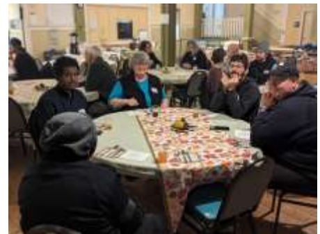
Recovery Thanksgiving Dinner