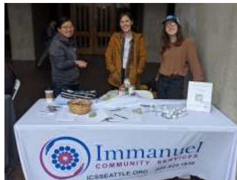
Board members & staff tabling at UW Dawg Daze