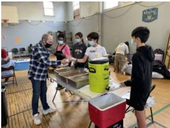
Lakeside School volunteers serving lunch