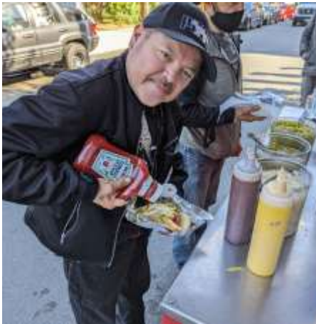
One of our volunteers brought her hot dog cart out as a treat for our hygiene center guests.