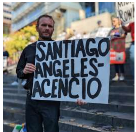
Remembering friends lost at a vigil for the homeless