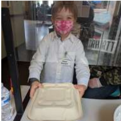
Little helper distributing lunches!