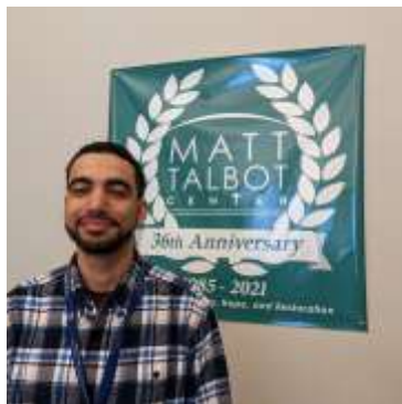
A former Recovery Shelter resident now is a case manager at Matt Talbot