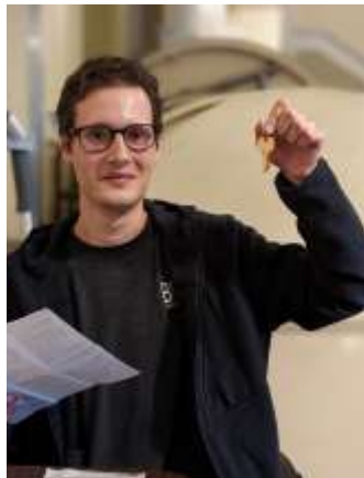
Moving into a new apartment