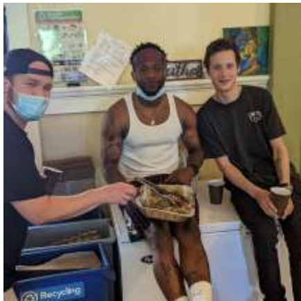
Celebrating a year of sobriety