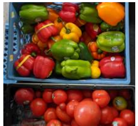
Veggies reporting for duty!