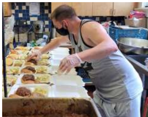
Volunteering to cook a meal for our Hygiene Center guests