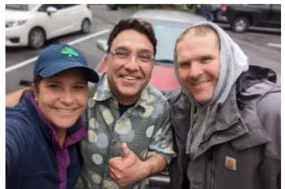
Both housed with over a year sober, they come back to volunteer at food bank.