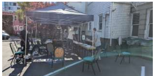
A highlight for the men in our program: Union Church's Monthly Supper Club