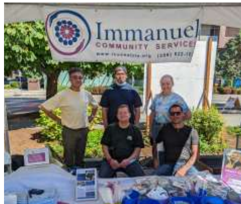
Helping at the ICS Booth at the SLU Block Party