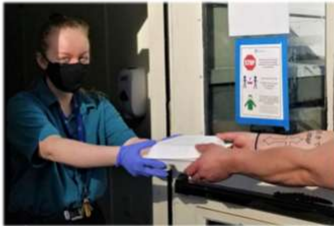
Volunteer handing out meals