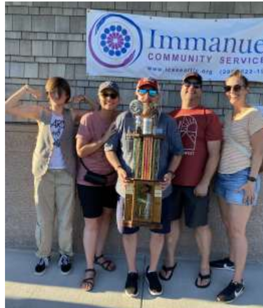
Our 2022 Winners!