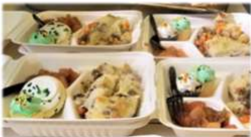
Serving lunch in To-Go Boxes