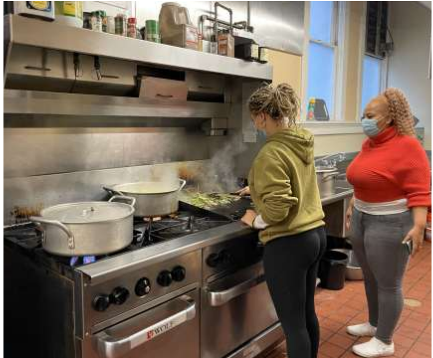
Volunteers making a delicious lunch for our guests.