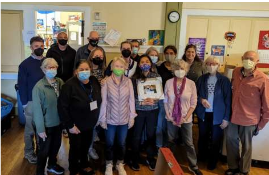
Our amazing team of volunteers