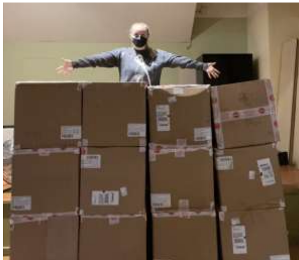
Donation from Bombas of new socks for our Hygiene Center guests