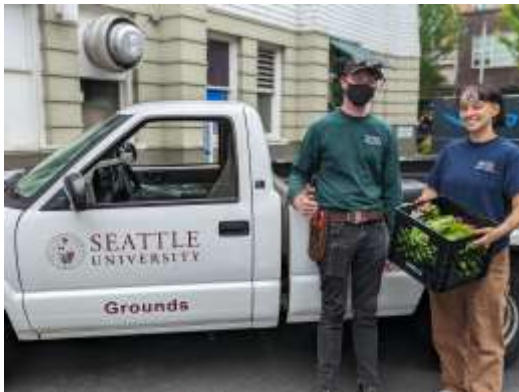
Thanks to Seattle University Grounds Crew for donating fresh vegetables fresh out of the SU garden!!