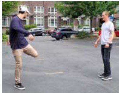
Residents play hacky sack on a sunny fall day