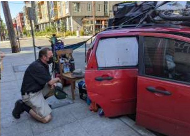
Outreach partner from Operation Nightwatch informing one of our guests that they now have permanent housing