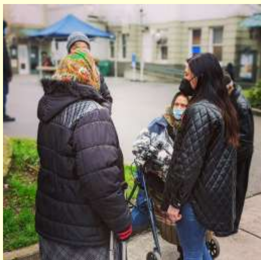
Hope Dignity Community

In February, when Ukraine was invaded, the entire ICS Food Bank community rallied around members of our community from Ukraine. We even located a Ukrainian translator to come talk with our friends and see how we could support them in this frightening & sad time.