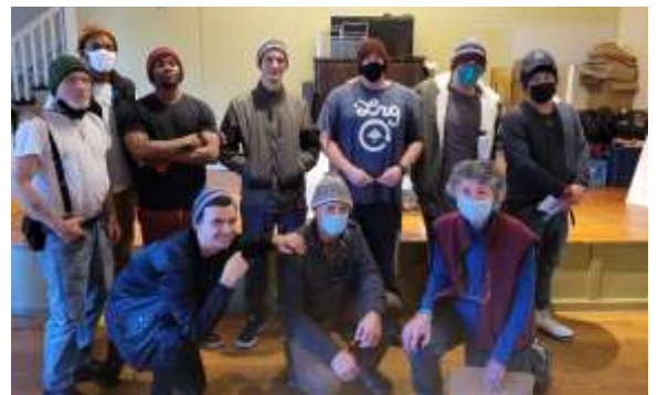
Receiving new knitted hats from a thoughtful donor